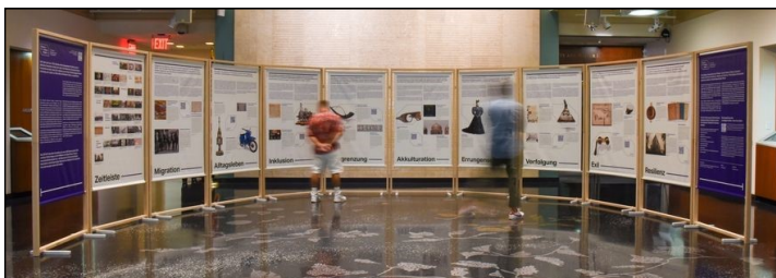
The Shared History Project at the Center for Jewish History, NYC.

From the Leo Baeck Institute in New York City comes Shared History Project: 1700 Years of Jewish Life in German-Speaking Lands . It explores how interwoven the lives of Jewish people and their non-Jewish neighbors have been in the 17 centuries since the presence of Jews in the Rhineland was first documented in a Roman Edict